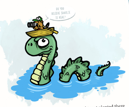
Payette Lake is 392 feet at it deepest, and trout planted there in the 1950s can weigh up to 30 pounds.